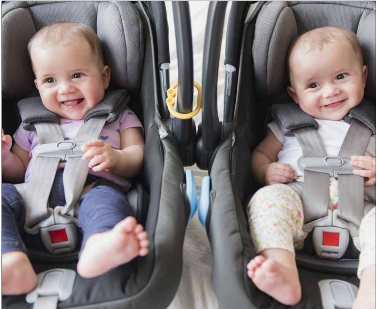
Proper safety seat use reduces the propensity for child injuries.

Booster seats are the next stage (3). High-backed booster seats provide more support than backless seats. Booster seats should be used as long as possible, until children outgrow the height and weight for the seat. Even then, another booster seat may be necessary before straight seatbelt use — which is Stage 4.