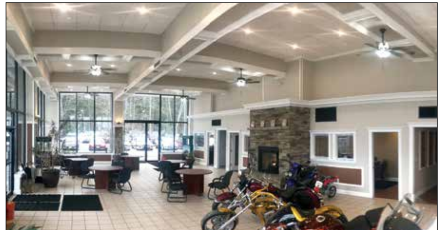
Shown is the upgraded interior showroom with some of the motorcycles that have been taken in trade alongside the warm, brand new stone fireplace.

"The Navigator's technology offerings make a big leap forward," said Roddy. "Wireless hotspot capability for up to 10 devices is standard, and a wireless charging mat up front is optional. There are six USB ports, four 12-volt ports and a 110-volt household outlet plug to keep devices juiced up. An available rear entertainment system mounts 10-inch screens to the back of the front seats, which can each play different content via an app, HDMI input or USB-connected device. Android devices will be able to stream content