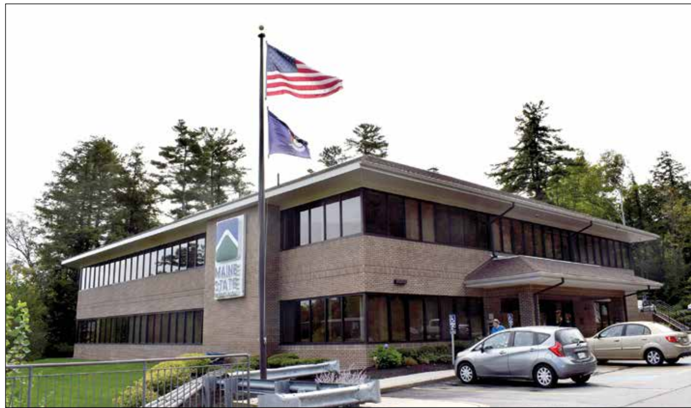
The main office of the Maine State Credit Union is located on Capital Street in Augusta. Even after business hours, dealerships can connect directly with MSCU's Indirect Loan Officers to arrange financing for vehicle buyers.

Drivers can have their vehicle batteries tested by mechanics. Batteries can be replaced at home or at a garage. Servicing the vehicle frequently can prevent performance inefficiencies and help determine if any components are straining the battery and causing premature loss of battery life.