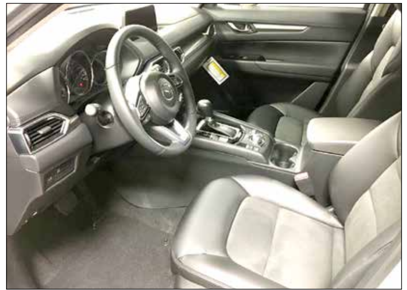
Contributed photos 2018 Mazda CX-5 SUV is shown at left. Above, the interior is comfortable and roomy with everything conveniently located for ease and efficiency.