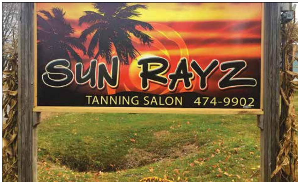
Sun Rayz Tanning & Hair Salon, Skowhegan.