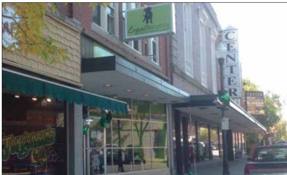
Loyal Biscuit in downtown Waterville.