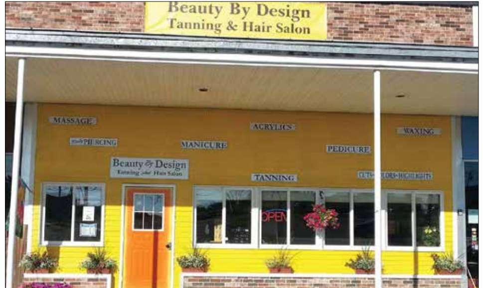
Beauty By Design in Skowhegan.