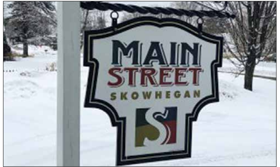
Main Street Skowhegan.