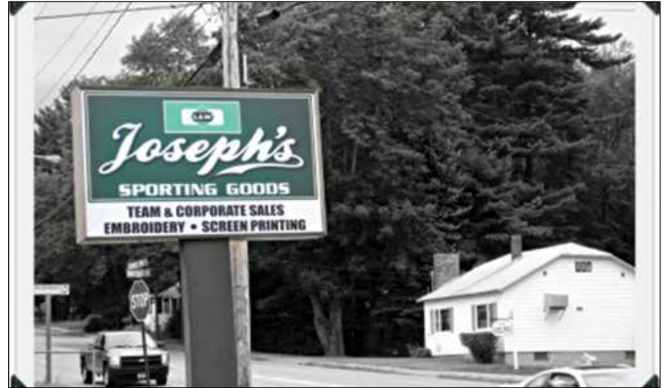
Joseph's Sporting Goods in Waterville.