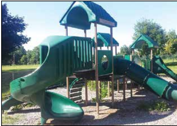
Quimby Childcare Center, Norridgewock.