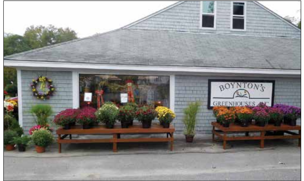
Boynton's Greenhouse in Skowhegan.