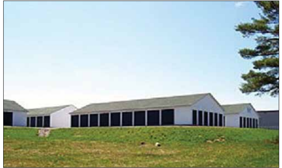
Pondwood Self-Storage in Waterville.