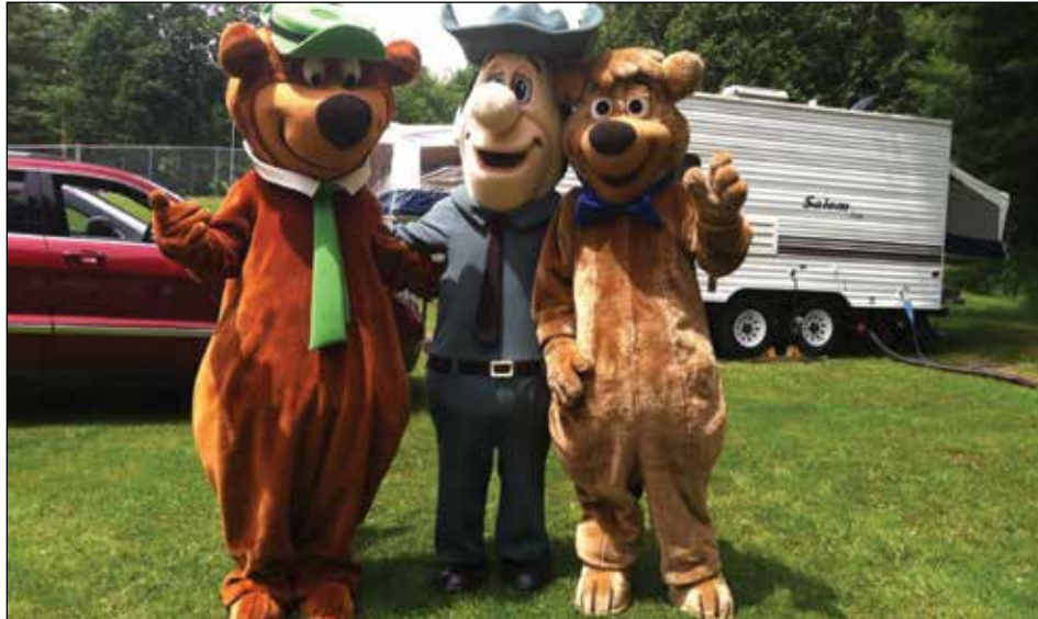
Yogi Bear's Jelly Stone™ Park at Yonderhill in Madison.