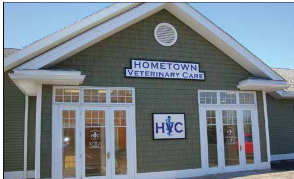
Hometown Veterinary in Fairfield.