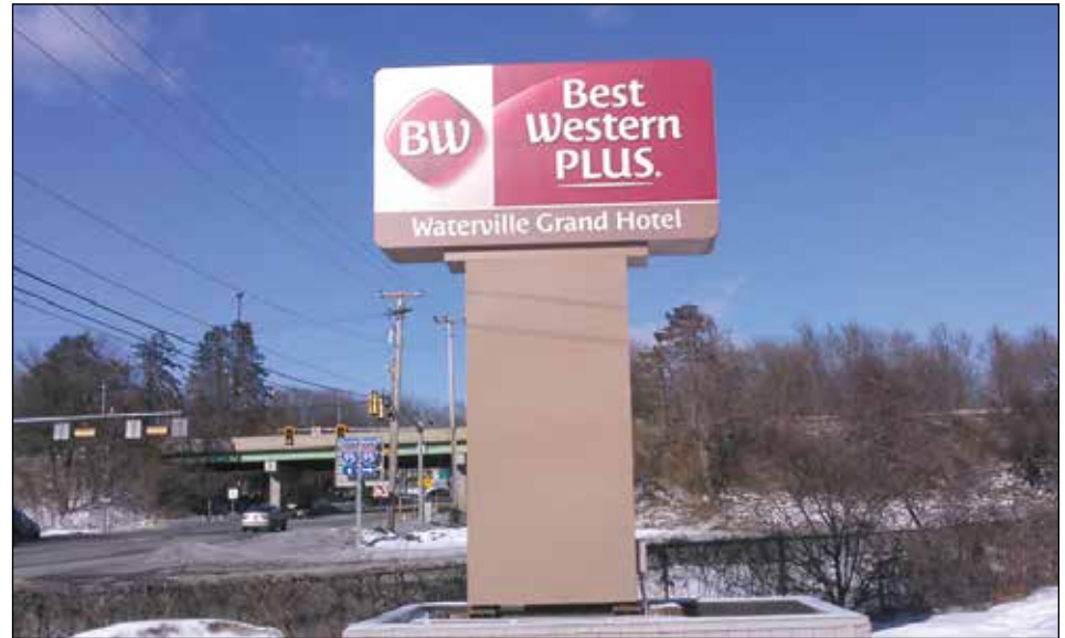
Best Western Plus Waterville Grand Hotel in Waterville.