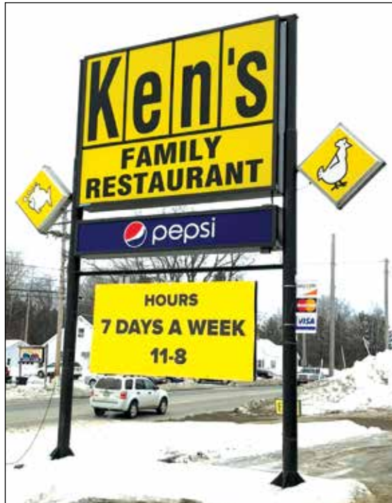
Ken's Family Restaurant in Skowhegan.