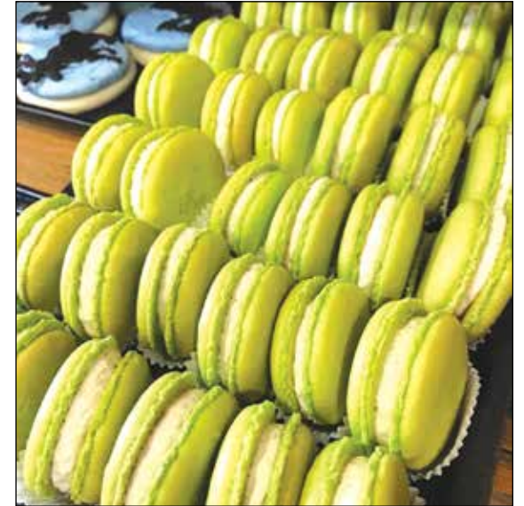
The Bankery in Skowhegan.