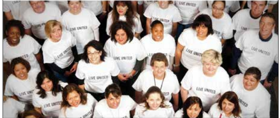
United Way of Mid-Maine in Waterville.