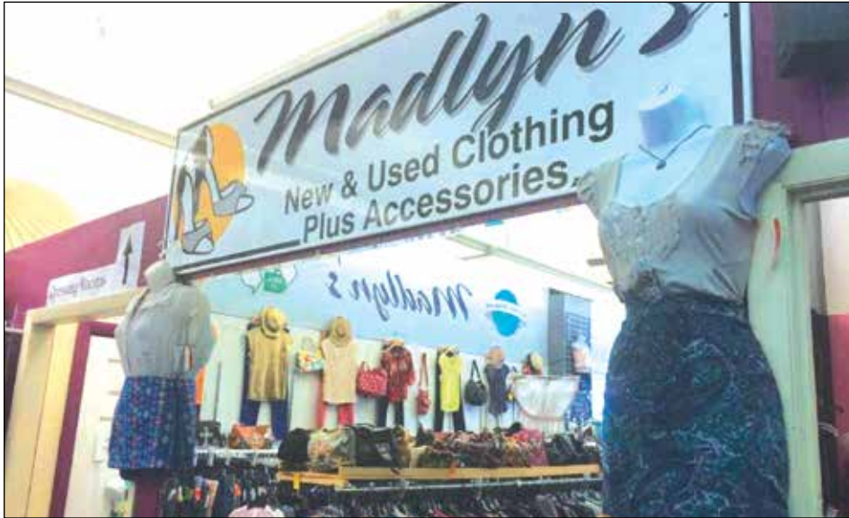
Madlyn's New & Used Clothing in Waterville and Skowhegan.