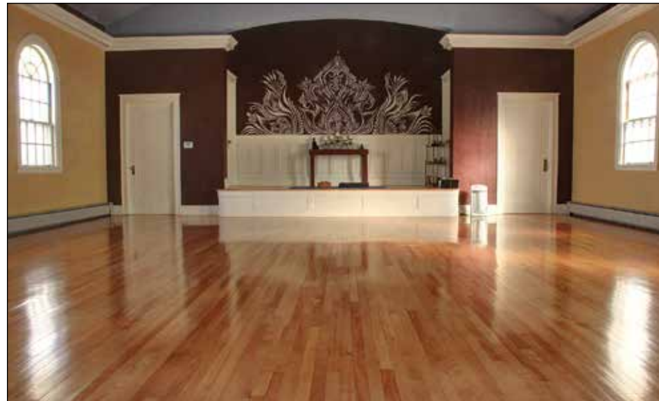
School Street Yoga, Waterville.