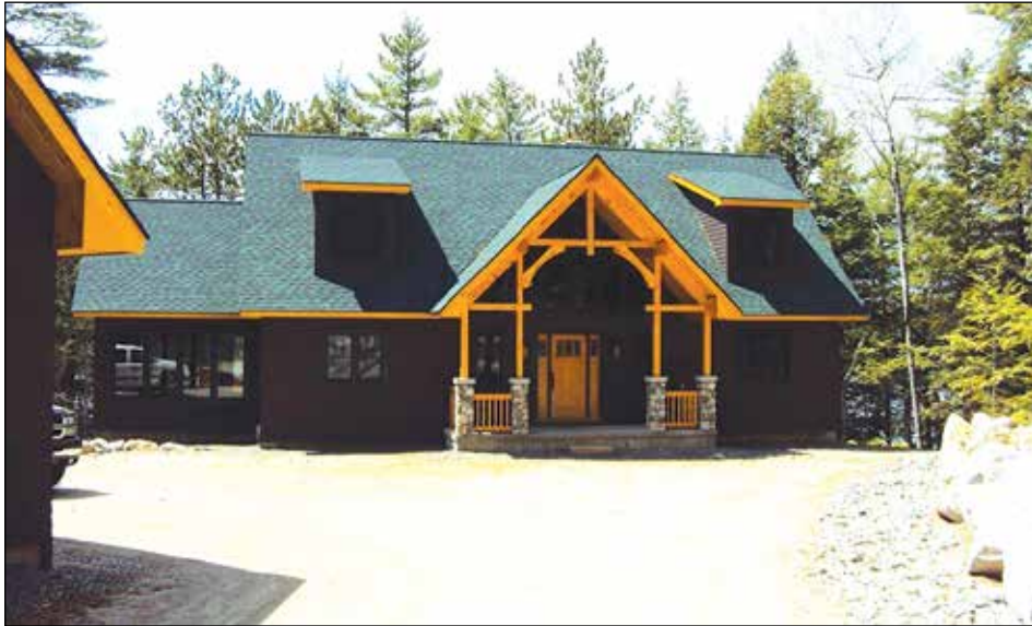
A home by Blanchet Builders from Skowhegan.