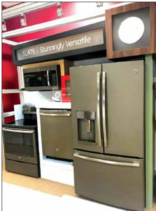
Fortin's Home Furnishings in Winslow.