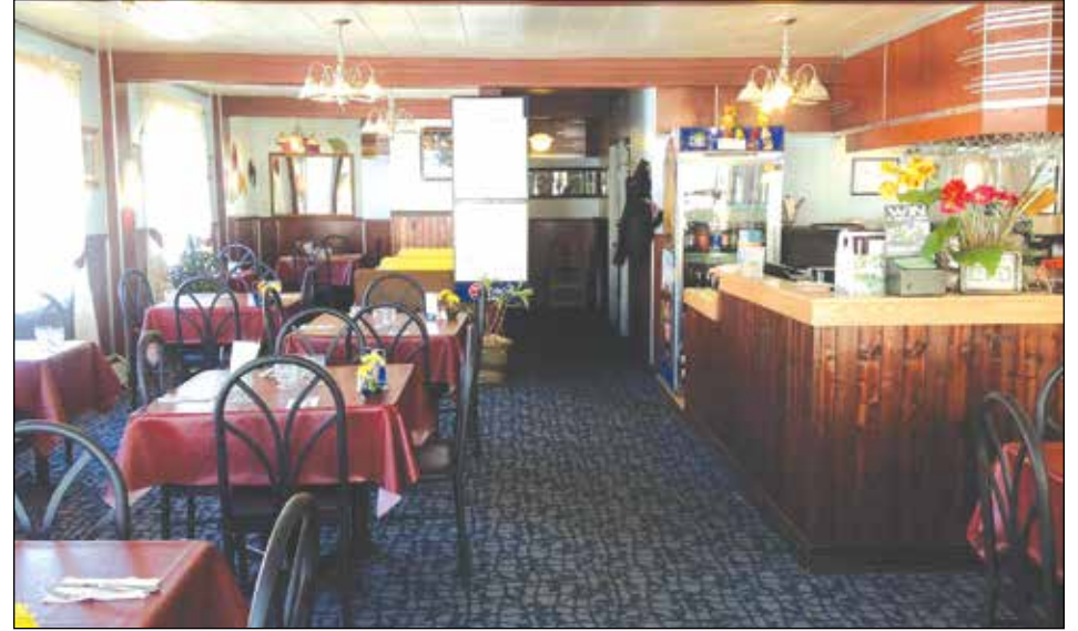
M. Thai Restaurant in Skowhegan.