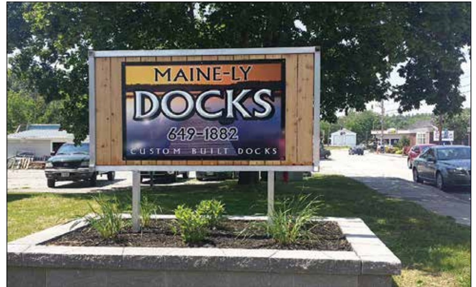
Maine-ly Docks in Oakland