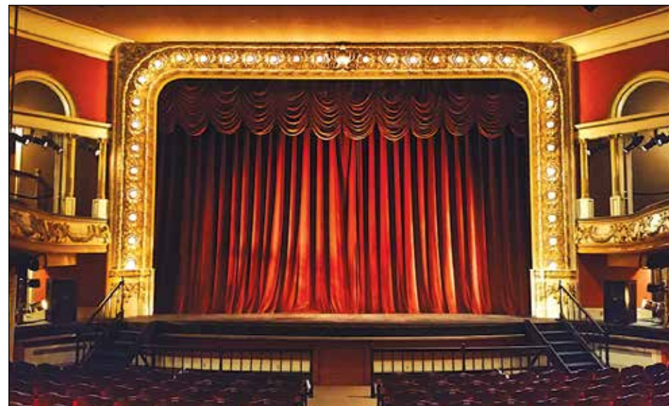
Waterville Opera House in Waterville.