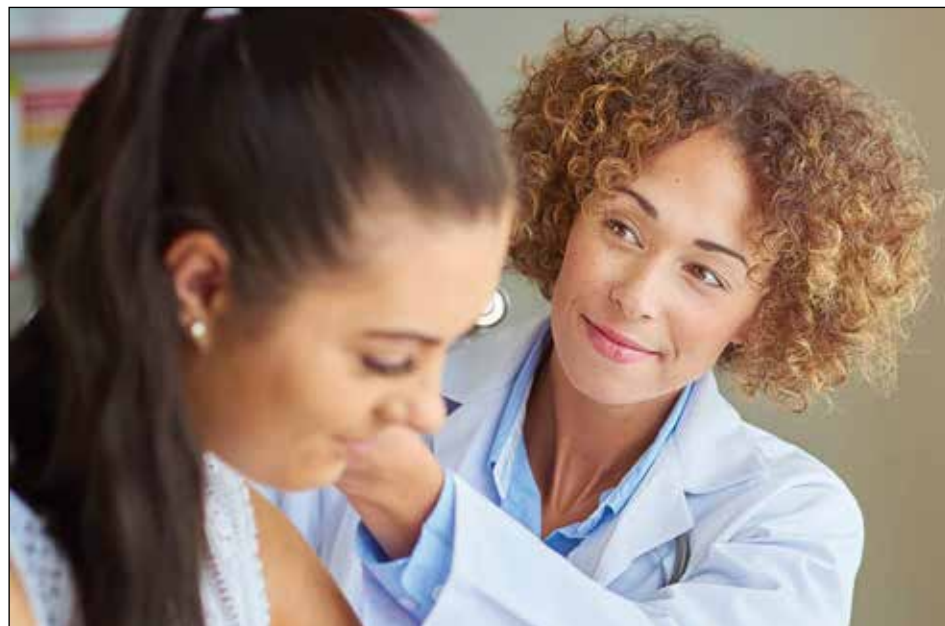
Beltone Hearing Aid Center in Waterville.