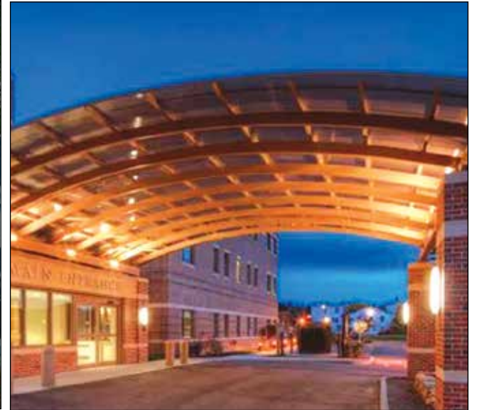
Redington-Fairview Hospital in Skowhegan.