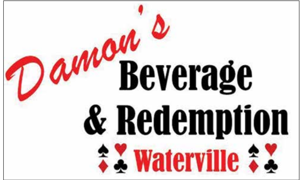
Damon's Beverage & Redemption in Waterville..