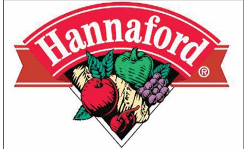
Hannaford Supermarkets in Waterville, Skowhegan, Madison and South China.