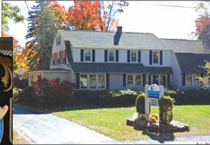
Smile Solutions in Waterville.