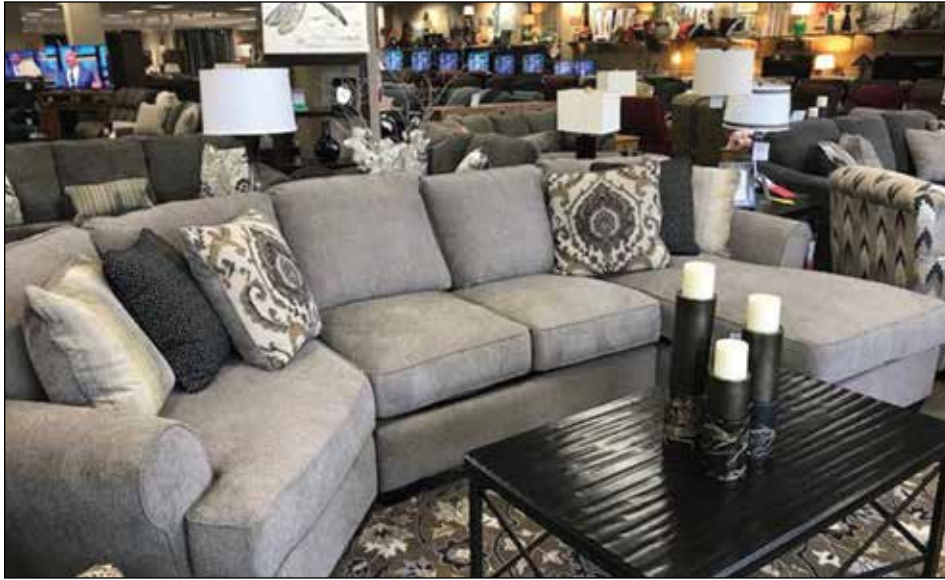
Fortin's Home Furnishings in Winslow.