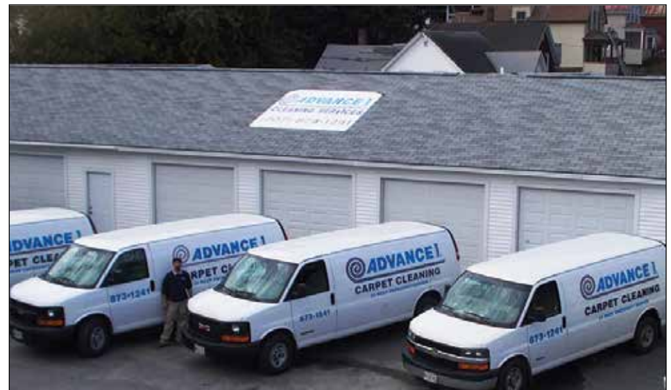
Advance 1 Cleaning in Waterville.