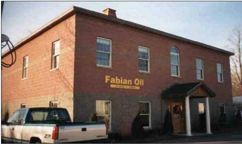
Fabian Oil in Oakland.