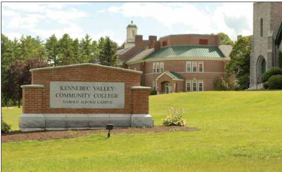
Kennebec Valley Community College on the Hinckley campus.