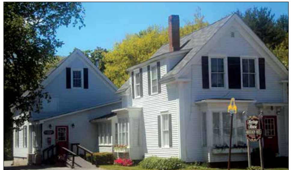
Heritage House Restaurant in Skowhegan.