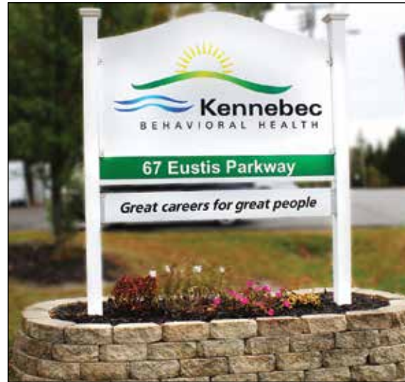
Kennebec Behavioral Health in Waterville.