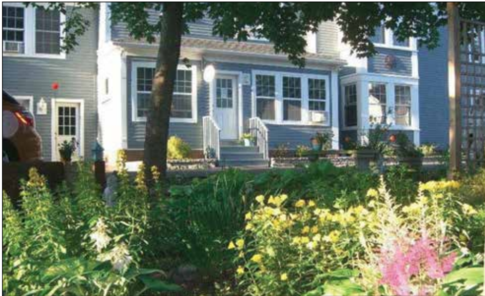
Pleasant Street Inn in Waterville.