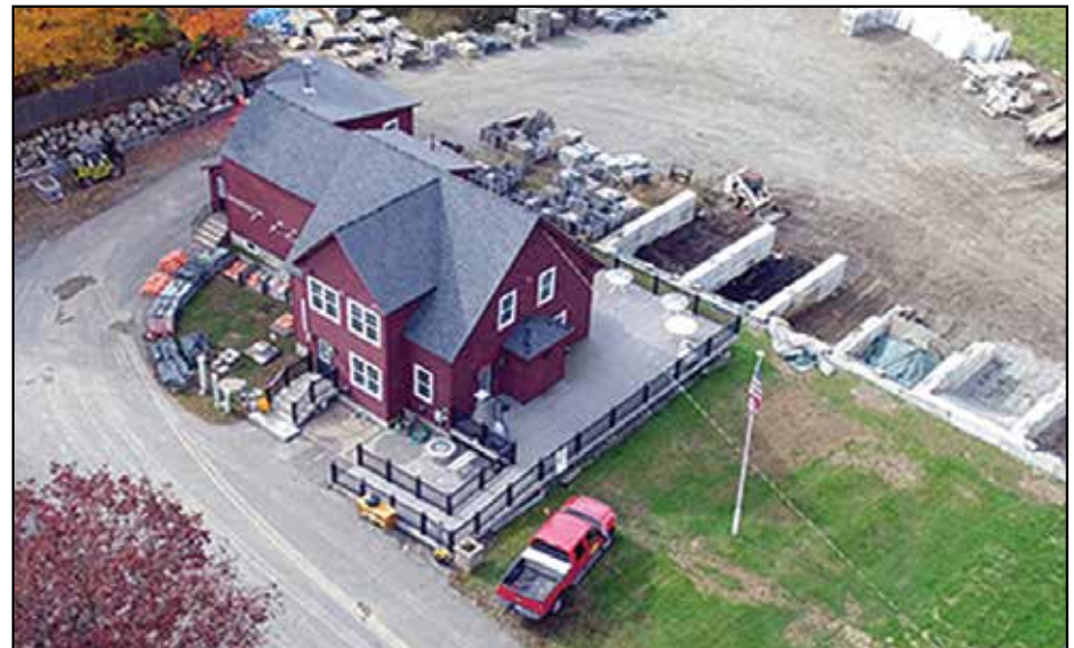
Somerset Stone & Stove in Oakland.