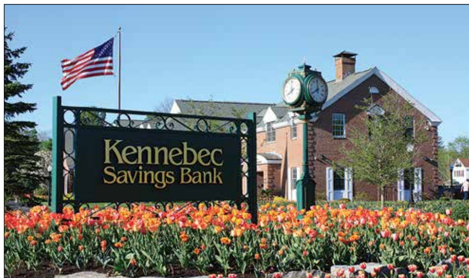
Kennebec Savings Bank in Waterville.