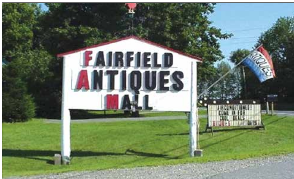
Fairfield Antiques Mall in Fairfield.