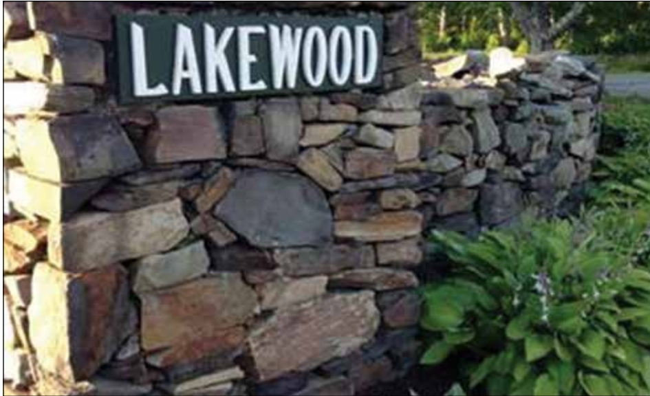
Lakewood Golf Course in Madison.