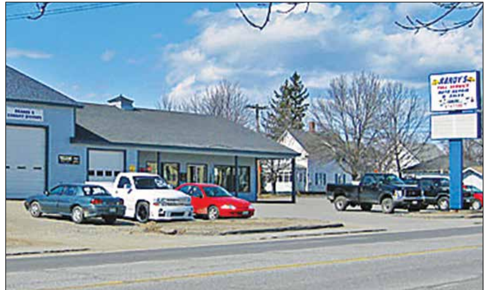
Randy's Full Service Auto in Skowhegan.