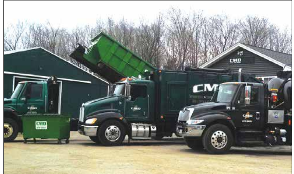
Central Maine Disposal in Fairfield.