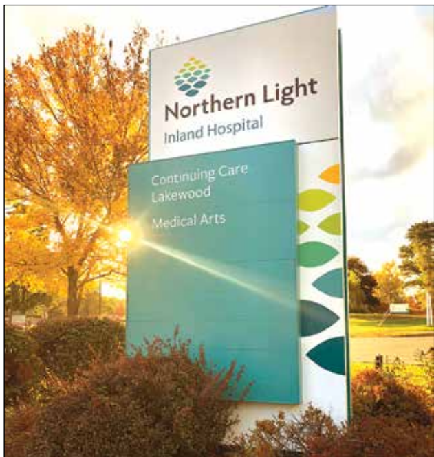
The new name and sign at Northern Light Inland Hospital in Waterville.