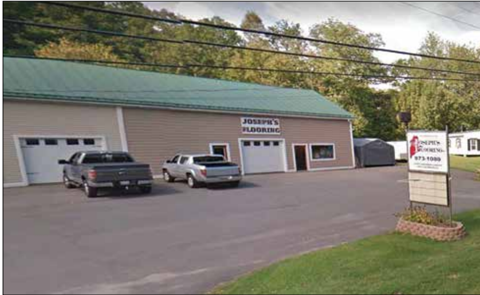
Joseph's Flooring in Winslow.