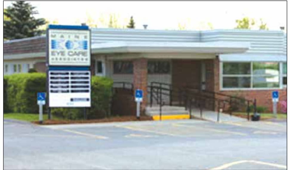
Eye Care of Maine in Waterville.