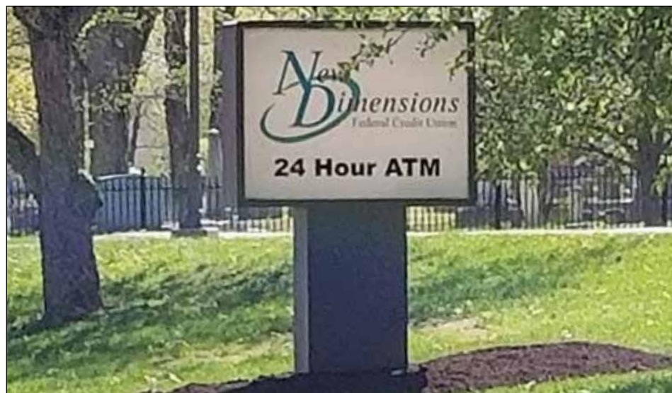
New Dimensions Federal Credit Union in Waterville.