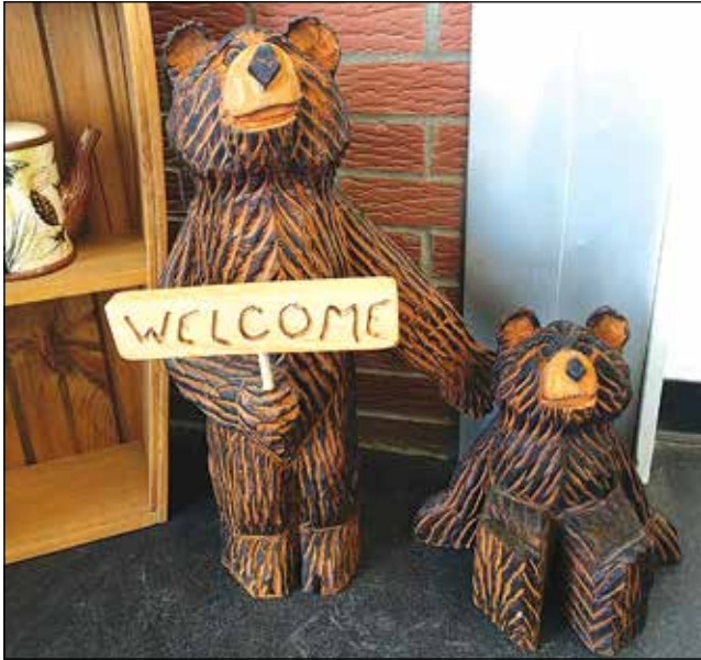
Maine Made & More in Waterville.