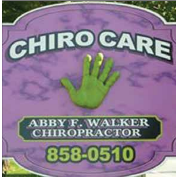
Chiro Care in Skowhegan.