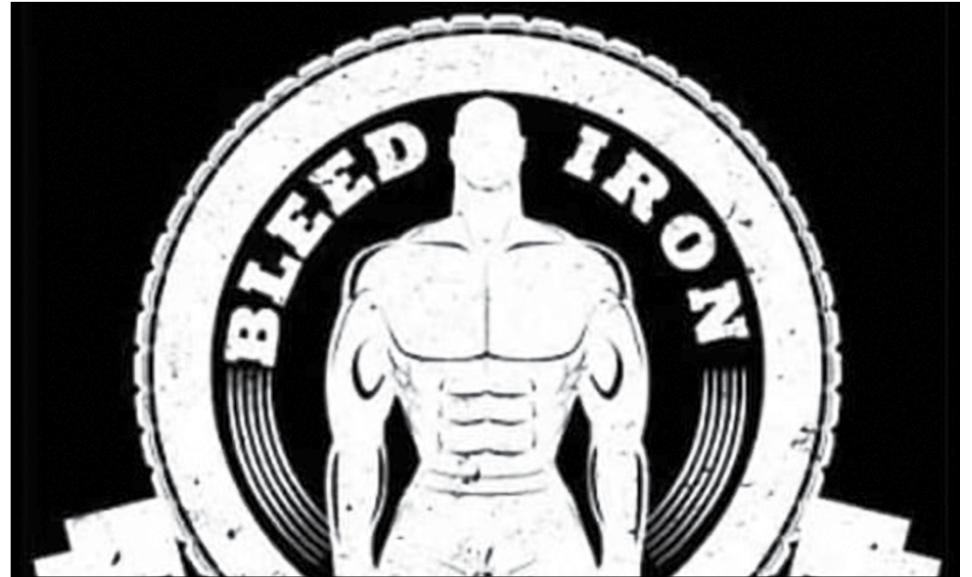
Miller's Fitness in Skowhegan.