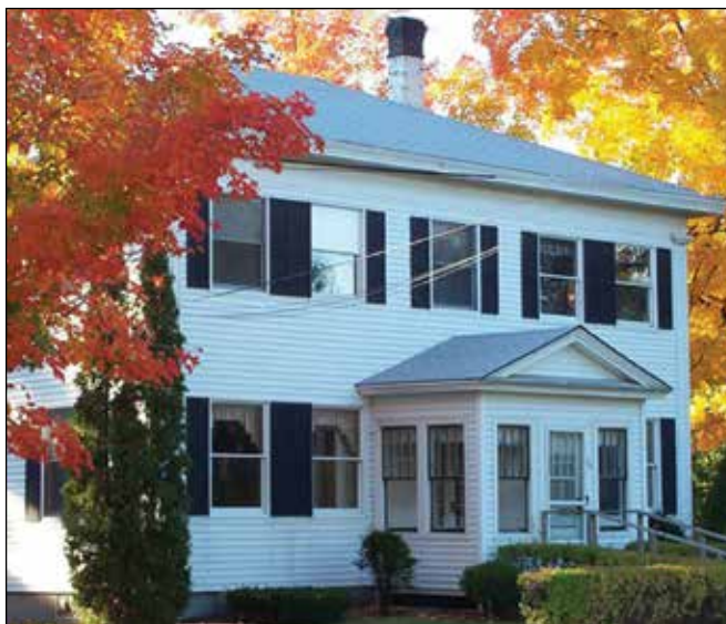
O'Donnell Lee, P.A. office in Waterville.