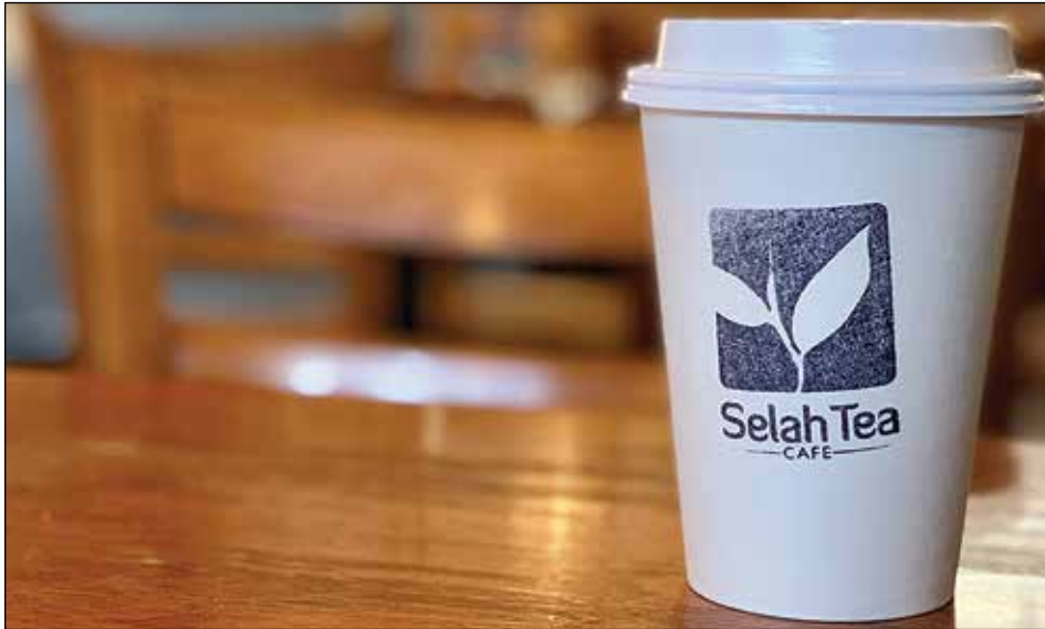
Selah Tea Cafe in Waterville.