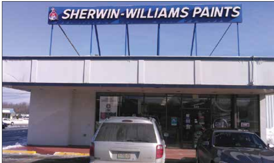
Sherwins-Williams Paint Store in Waterville.