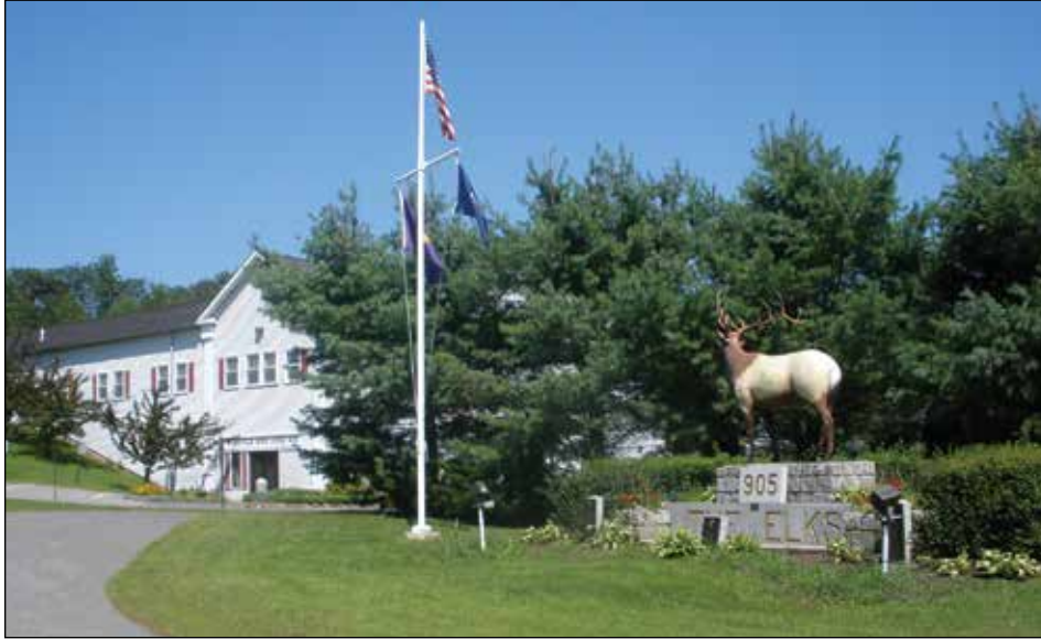
Waterville Elks Lodge #905.