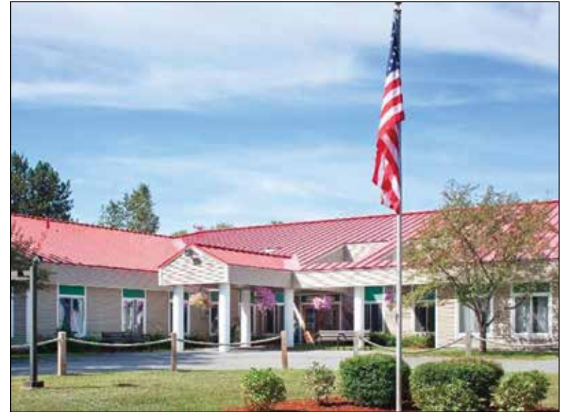
Cedar Ridge Center in Skowhegan.