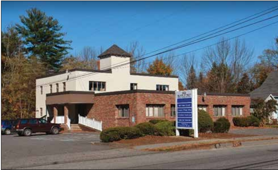
Coldwell Banker Plourde Real Estate in Waterville.