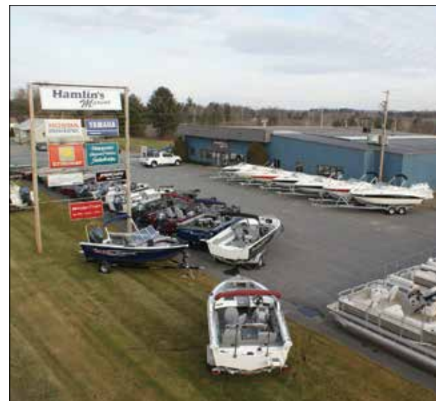
Hamlin's Marine in Waterville.