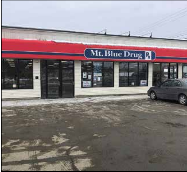
Mt. Blue Drug in Farmington.