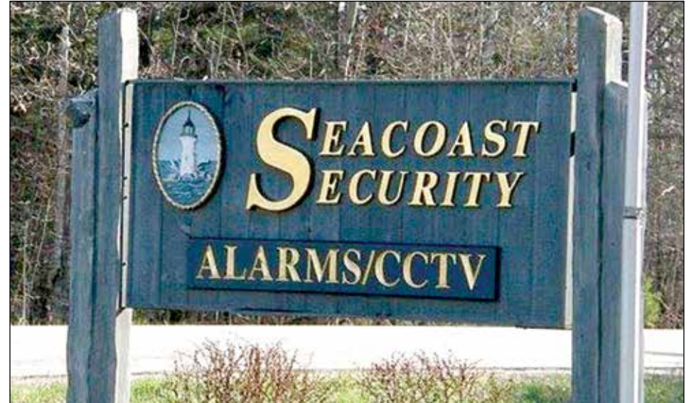
Seacoast Security in Waterville.