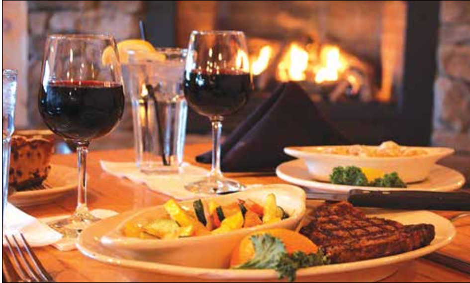
Joseph's Fireside Steakhouse in Waterville.