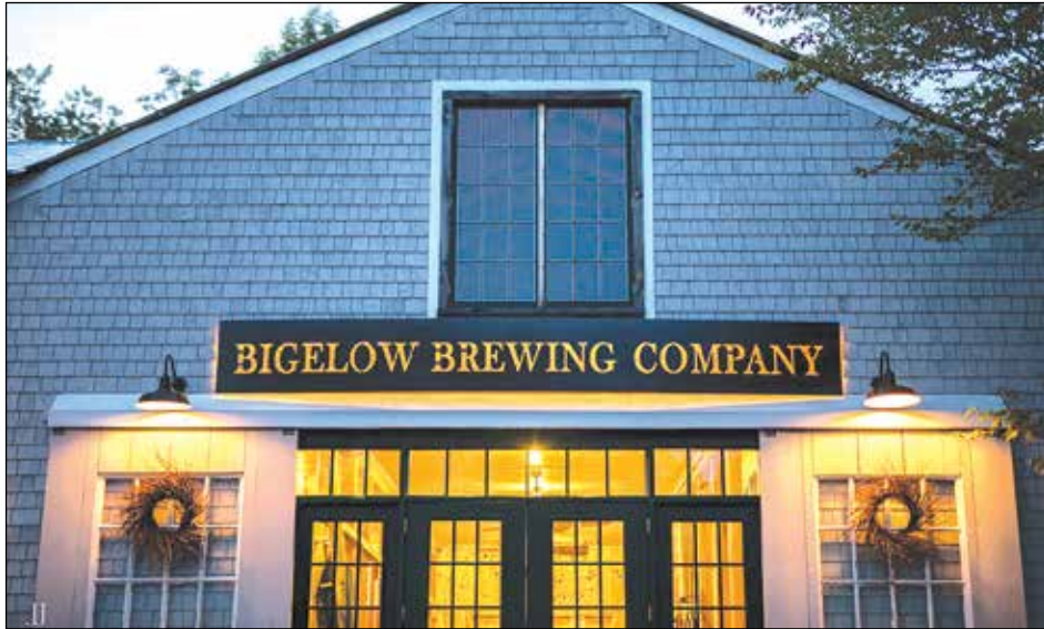
Bigelow Brewery in Skowhegan.