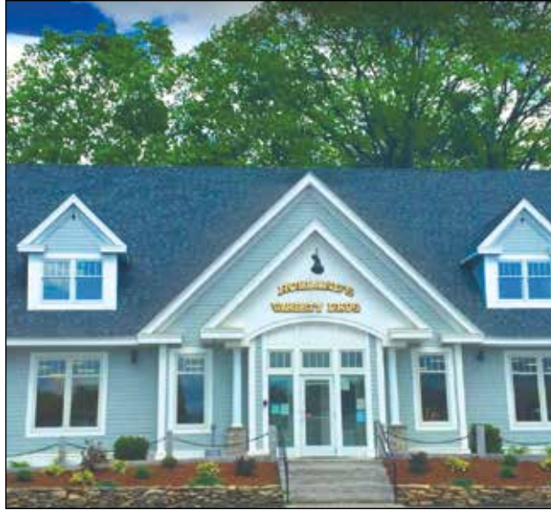
Holland's Variety Drug in Skowhegan.