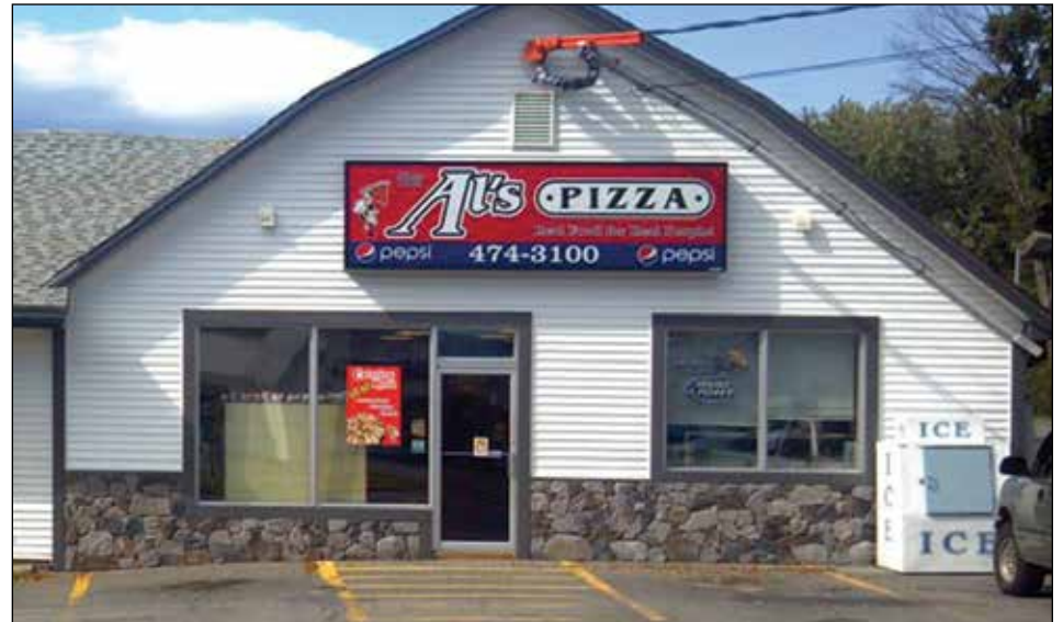
Al's Pizza in Skowhegan.