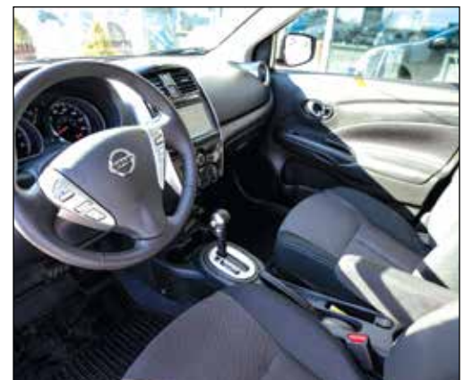
2019 Nissan Versa interior.

And that's what new car buyers should expect, even at these prices.