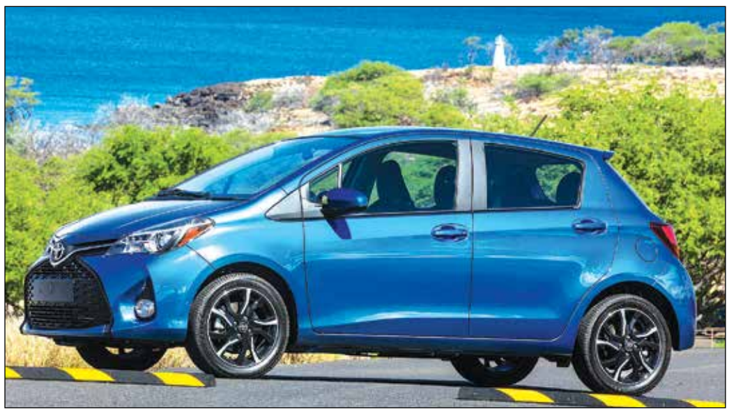
2019 Toyota Yaris