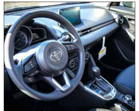
2019 Toyota Yaris interior.

Buyers need not fret about just having an