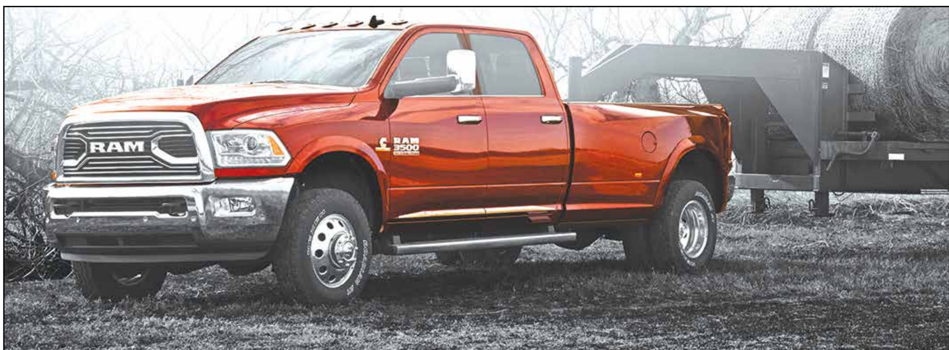
The all-new, heavy-duty Ram 3500 guarantees the industry's best in hauling and towing capabilities.