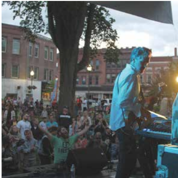
WATERVILLE ROCKS! Castonguay Square June 28, July 5, July 26, August 2