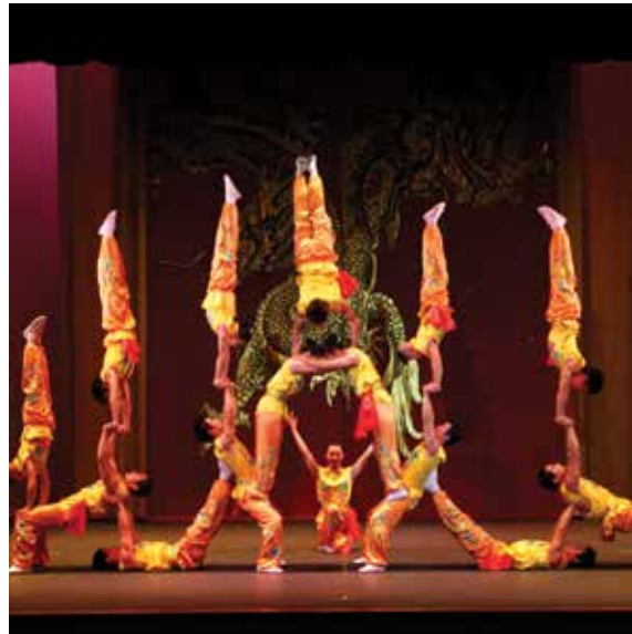
PEKING ACROBATS Waterville Opera House July 6