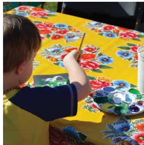
ART IN THE PARK RiverWalk | Head of Falls Thursdays June - August