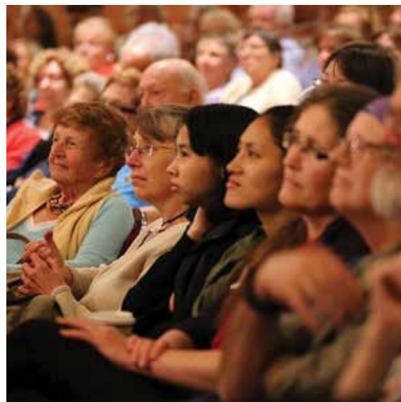
22nd MAINE INTERNATIONAL FILM FESTIVAL July 12 - 21 Purchase MIFF passes online today!