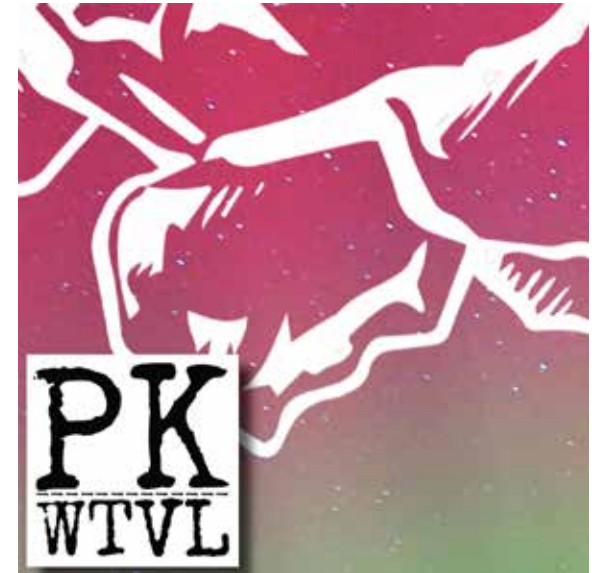
PECHAKUCHA NIGHT WATERVILLE V.32 Castonguay Square July 11