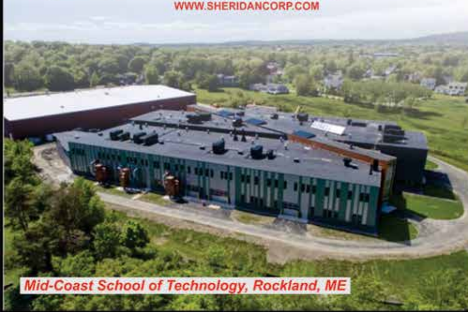
Mid-Coast School of Technology, Rockland, ME

Building on our promise. WWW.SHERIDANCORP.COM